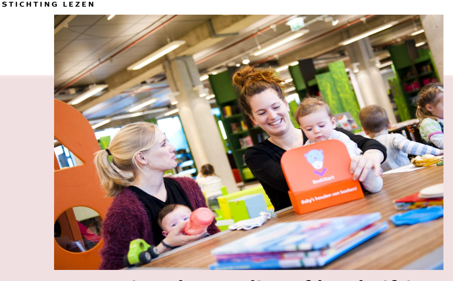
Improving the quality of bookgifting