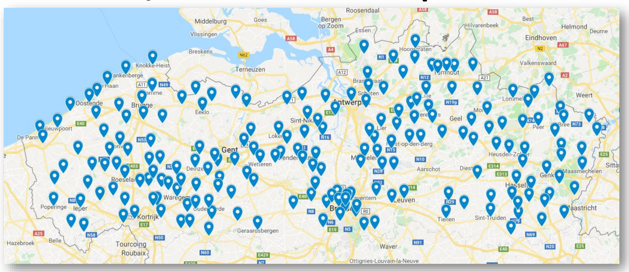
+/- 44 000 baby packs at age 6 months & +/- 25 000 toddler packs at age 15 months